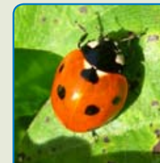
7 Spot Ladybird